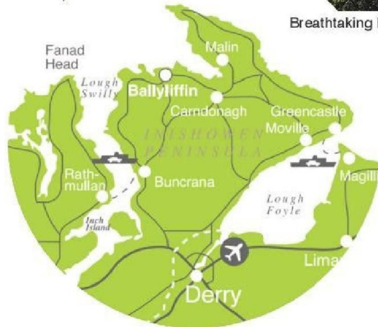
Inishowen Peninsula Map