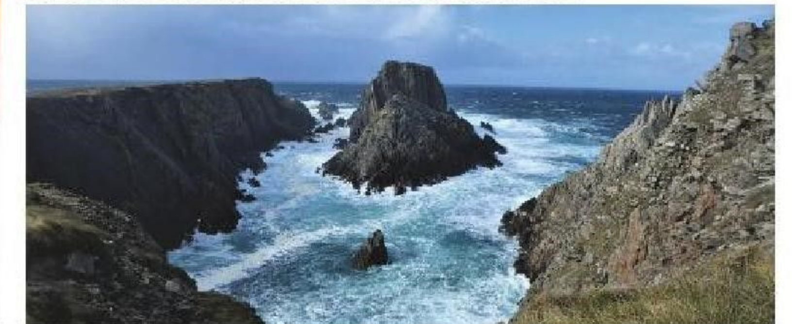
Rugged coastline at Ireland's Most Northerly Point, Malin Head