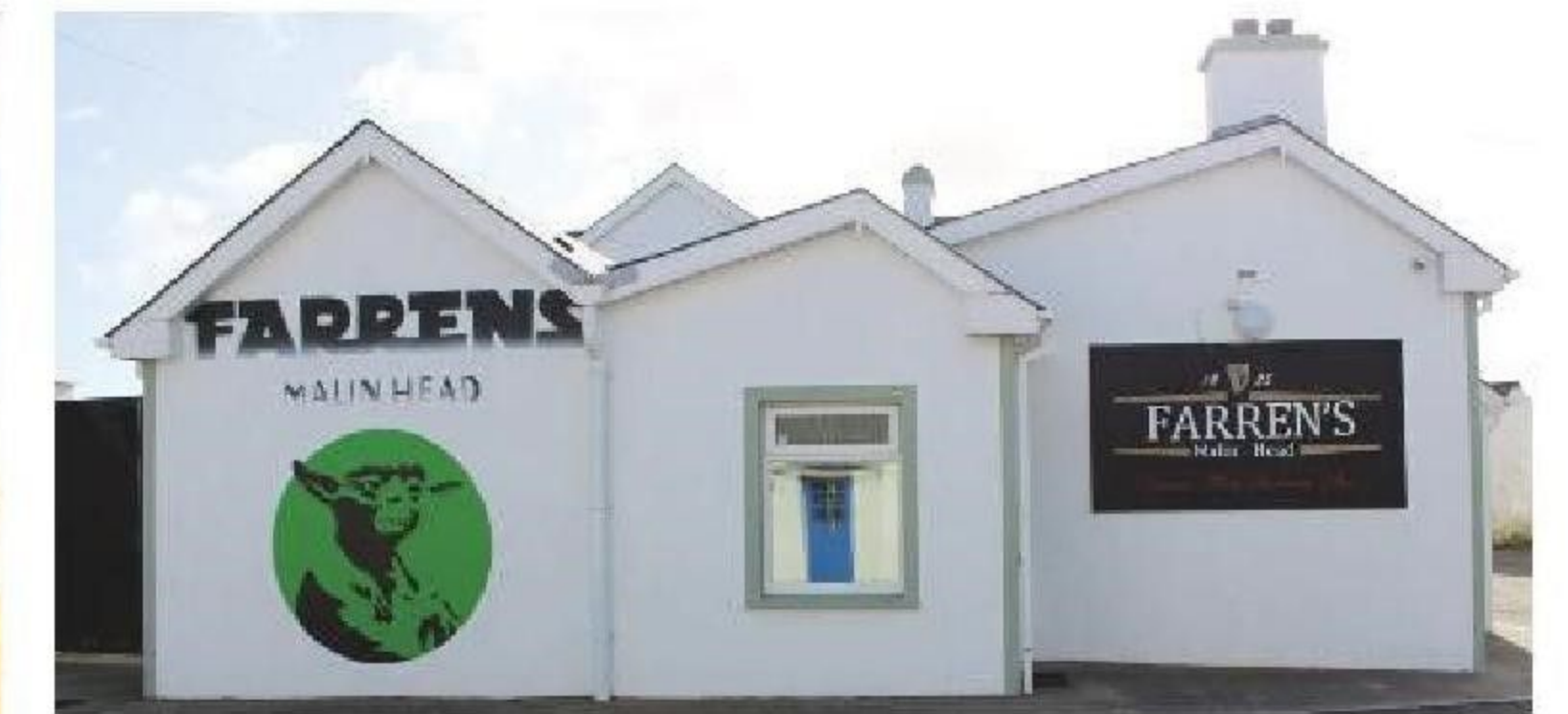
Infamous Yoda Mural at Farren's Bar, Malin Head