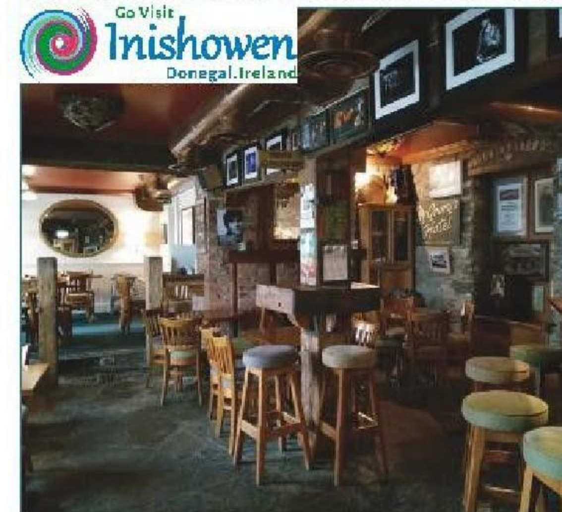
McGrory's Hotel Culdaff, Inishowen