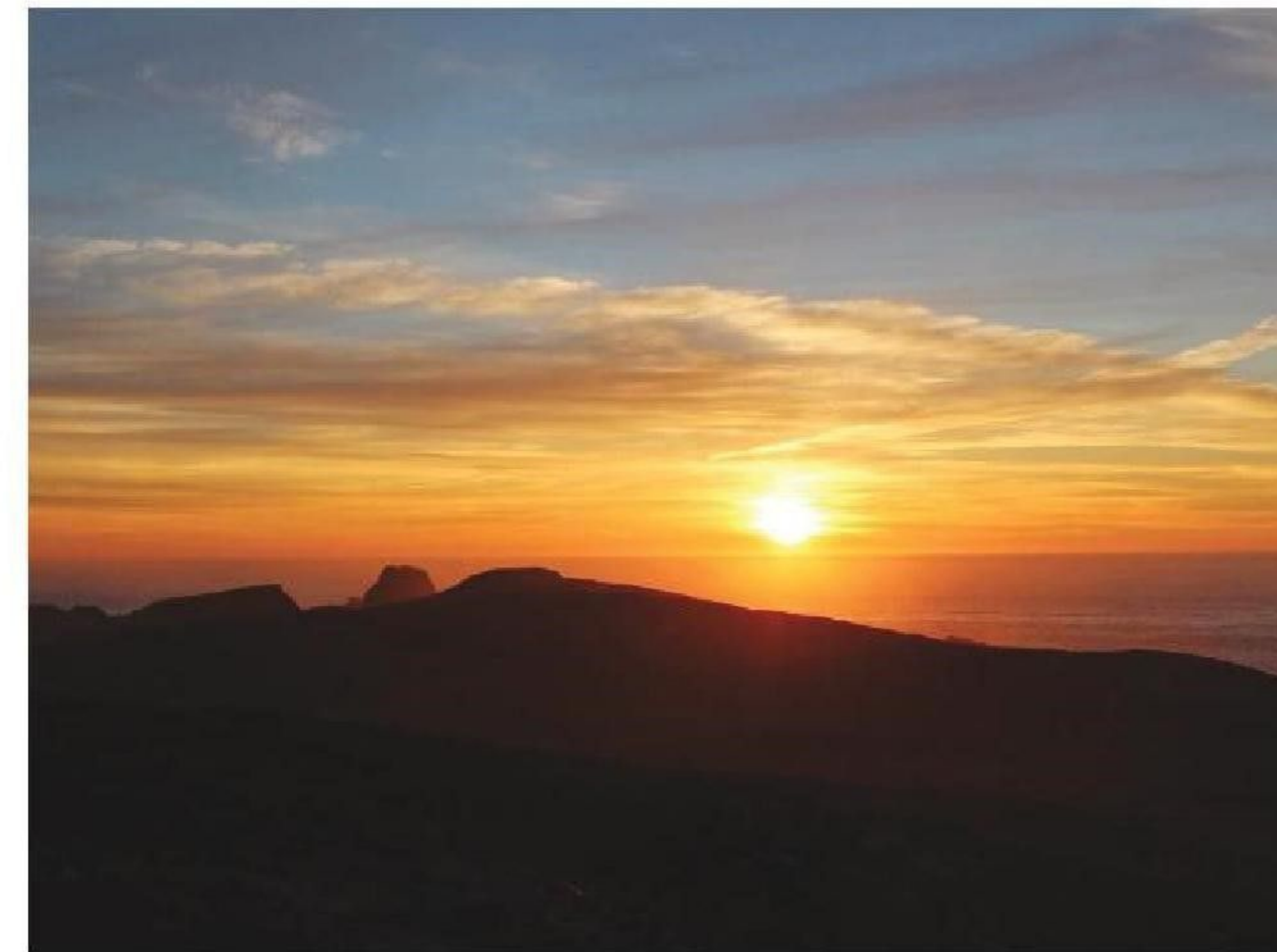
Sunset at Ireland's Most Northerly Point, Malin Head, Inishowen