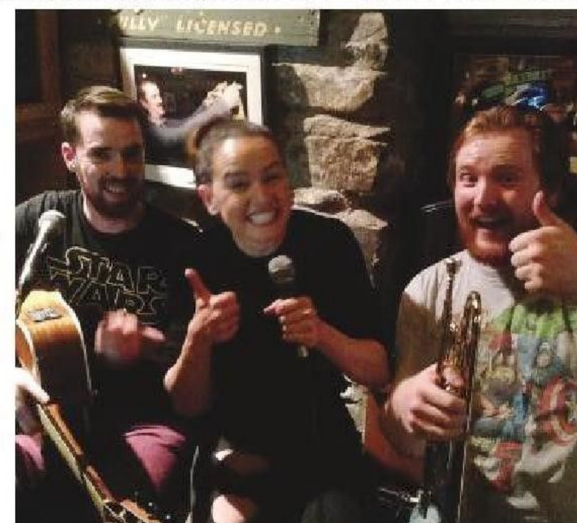
Daisy Ridley with local band Tasty at McGrory's Hotel, Culdaff