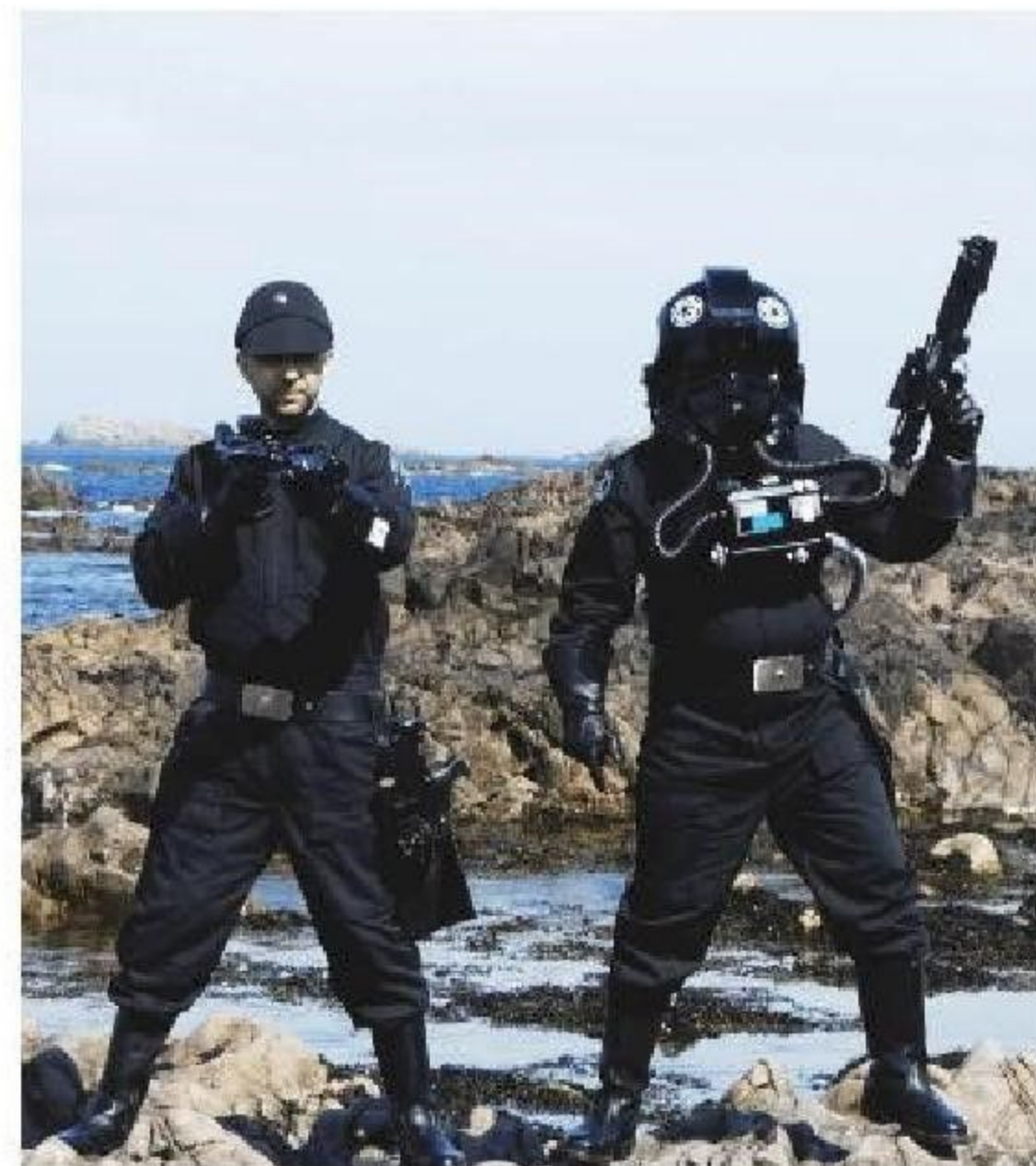
Dastardly TIE Pilots along the Ahch-To Way