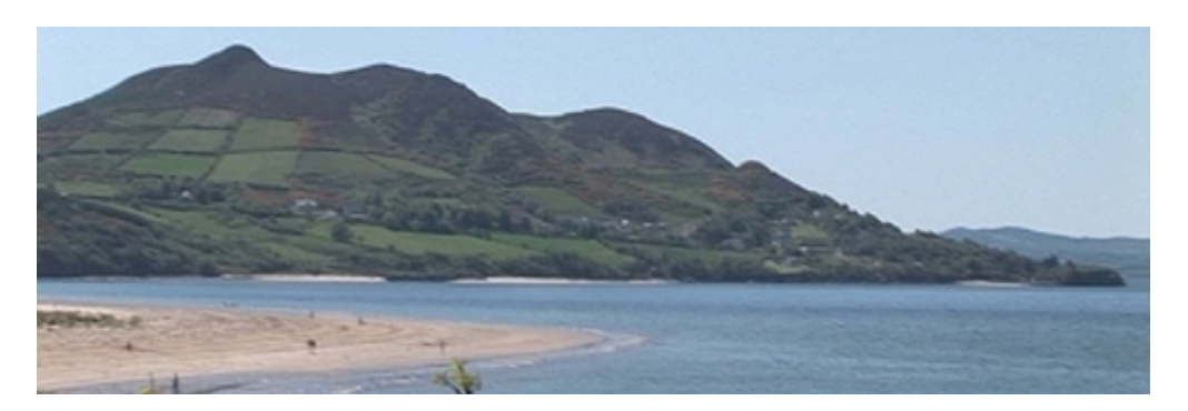
09.30- Discovery Point: Lisfannon Beach

Departing Buncrana heading towards Fahan, the first stop was Lisfannon beach, the first of our three Blue Flag beaches. It is accessible via the R238, through relatively flat landscape with clear continual views to Lough Swilly and distant headlands. This is a sandy beach on the shores of Lough Swilly. The location is a Natural Heritage Area (NHA), an important wetlands site for birds. Fahan Wood within 1km of the beach is classified as being of Regional Importance noted for Oak, Hazel and Rowan.